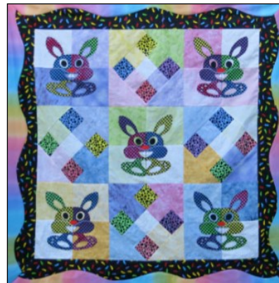
Bunny Hop Quilt 48"x48"