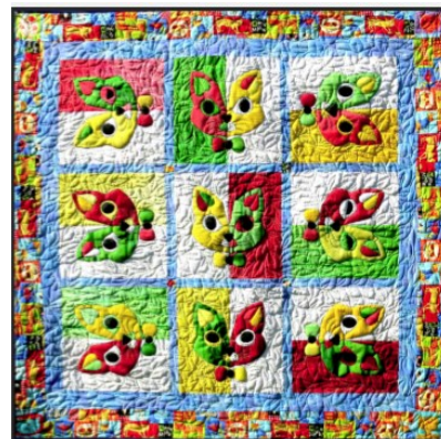
Foxy Kitty Quilt 49"x49"