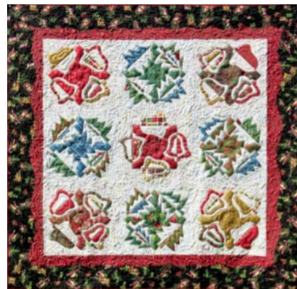
First Noel Quilt 52"x52"