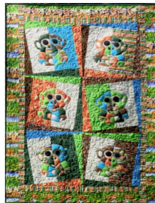
Monkey Business-Quilt 33½"x47"